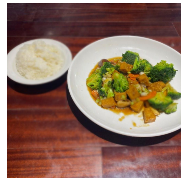
STEAMED VEGGIES & RICE