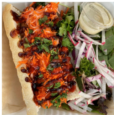
SPICY BANH MI