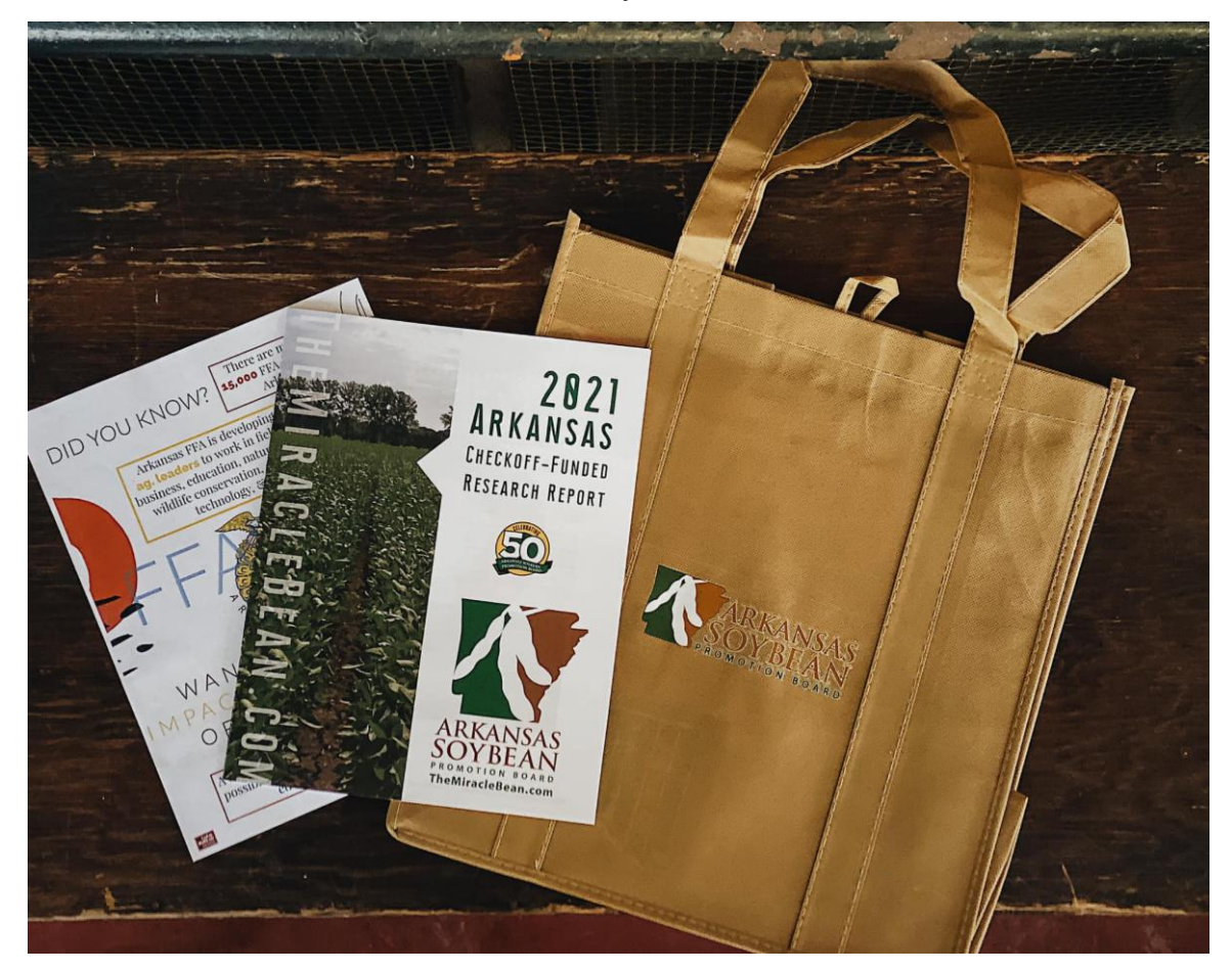
To celebrate Arkansas Soybean Month we gave out free 50th anniversary tote bags at the <u>St. Joseph Center of Arkansas</u>, <u>The Brambles</u>, and the <u>Olde Crow General Store</u>.

As we wrap up November, we can't help but feel thankful for everyone who participated in the <u>Arkansas Soybean Month</u> celebration. A special thanks to Governor Asa Hutchinson for helping ASPB promote Arkansas Soybean Month and the Board's 50th anniversary on KATV Channel 7. Check out our Arkansas Soybean Month release <u>here</u>.