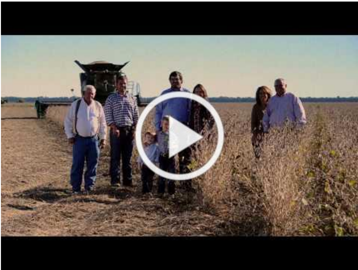
WATCH SOYBEAN BRAND DOCUMENTARY

While you’re on the website, check out information about agriculture , the latest featured research , a news release announcing Arkansas Soybean Month and the ASPB Soybean Brand Documentary.