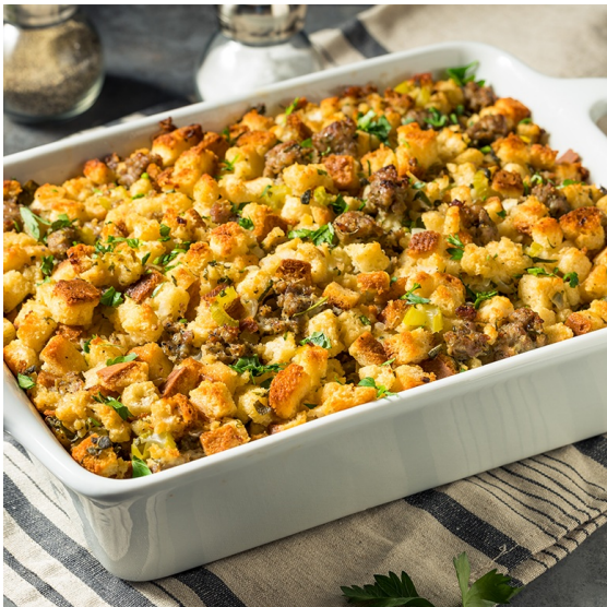
Savory Soy-Based Stuffing

While you’re on the website, check out information about agriculture , the latest featured research , a news release announcing Arkansas Soybean Month and the ASPB Soybean Brand Documentary.