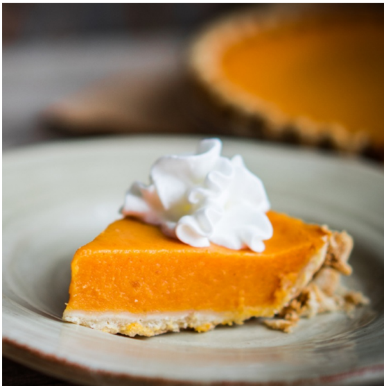
Soy Sweet Potato Pie

Celebrate Arkansas Soybean Month by bringing soy to your table. Soy offers many health benefits, including being the only source of complete vegetable protein. Visit our website to try these soy recipes and others you can incorporate into your Thanksgiving dishes.