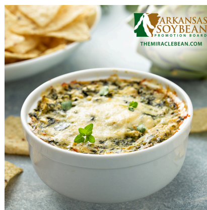
Spinach Artichoke Dip

Find more ideas for adding soy to your diet by visiting themiraclebean.com with the button below!